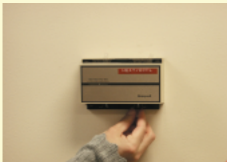
One of the most important steps: Turn off your heating/cooling system.

The goal of Shelter In Place is to prevent contaminated outside air from entering your home or other shelter for the duration of the incident. Incidents usually last a few hours, not days or weeks.